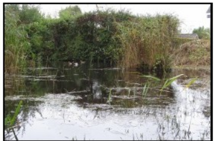
Lingwood Pond after the rain on 6th Oct

At the time of writing, 16th of October, half way through the month I've recorded 122mm or 4.75inches of rain. Added to the heavy rain at the end of September we've had 7.25 inches in the last 25 days, over a quarter of our expected annual rainfall. Despite this we are now only a little above average for the year so far. Time will tell whether we are due for more heavy rain this month. The wettest month I have on my records was June 2007 with 166.7mm.